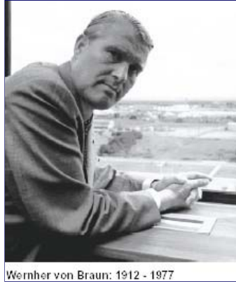
Wernher von Braun: 1912 - 1977