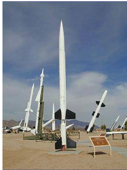
On June 26, 1948, two rockets, a V-2 and an Aerobee, were launched from White Sands Proving Ground, New Mexico. The V-2 attained 60.3 miles, while the Aerobee attained 70 miles altitude. Photo of Aerobee Hi Missile, White Sands Missile Range Museum.