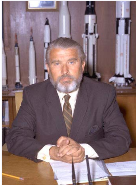
German physicist, Wernher von Braun, in his new NASA headquarters office, 1970. On March 1, 1970, von Braun relocated to Washington, D. C. to be Deputy Associate Administrator for Planning at NASA Headquarters until May 26, 1972, when he and NASA parted ways after the end of the Apollo program and many conflicts about the direction U. S. space flight projects should go.