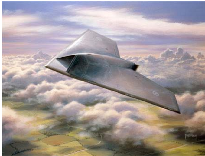
BAE Taranis, an Unmanned Combat Air Vehicle (UCAV) technology. BAE describes Taranis's role: "This £124 million, four-year programme is part of the UK Government's Strategic Unmanned Air Vehicle Experiment (SUAVE) and will result in a UCAV demonstrator with fully integrated autonomous systems and low observable features."

Now, what's extraordinary about this as you well know, normally the U. K. Ministry of Defence would bend over backwards to avoid any public speculation or discussion about prototype for military aircraft or drones and Black Projects and that sort of thing.