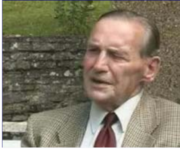
Lord Peter John Hill-Norton. February 8, 1915 - May 16, 2004.

[ Editor's Note: Wikipedia - Lord Peter John Hill-Norton (Feb. 8, 1915 to May 16, 2004) was a five-star Admiral of the Fleet, was Chief of the Defence Staff of the United Kingdom and Chairman of the NATO Military Committee. In later years he took an interest in UFOs, which included inquiries to Parliament about the December 1980 RAF Bentwaters and Rendlesham Forest light, beams and craft encounters.]