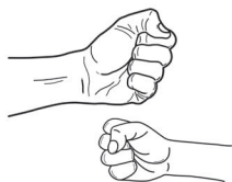
CAPTAIN — PARENT IN CHARGE

In my book Parenting Without Power Struggles , I described three ways that parents can engage with their children: being confidently and calmly in charge, negotiating for power, or fighting their child for control.