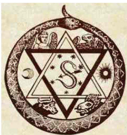
Seal of the Hermetic Brotherhood of Luxor