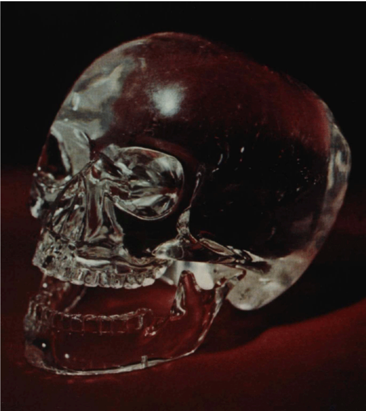
The Mitchell-Hedges Crystal Skull Showing the detachable jaw