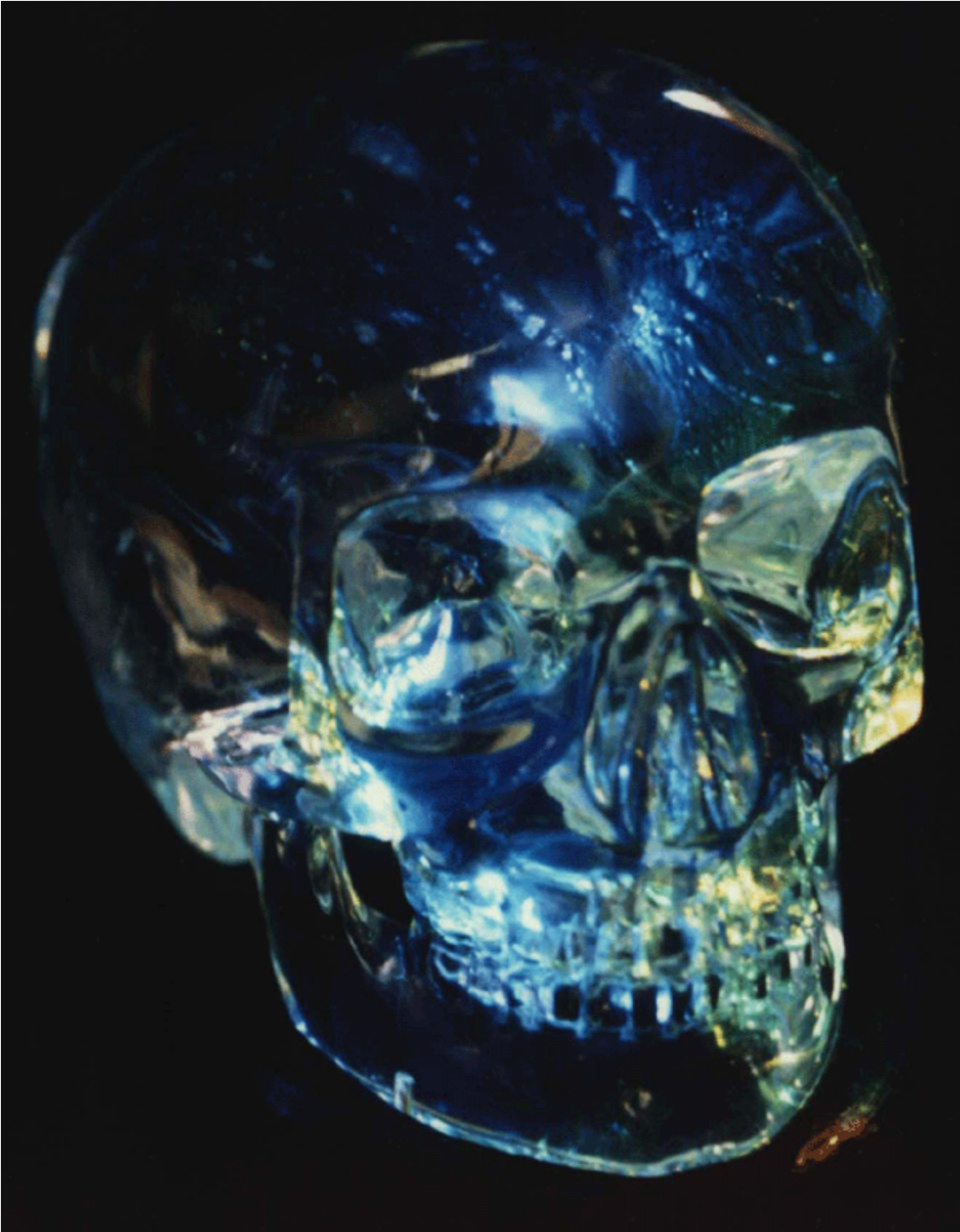
The Mitchell-Hedges Crystal Skull