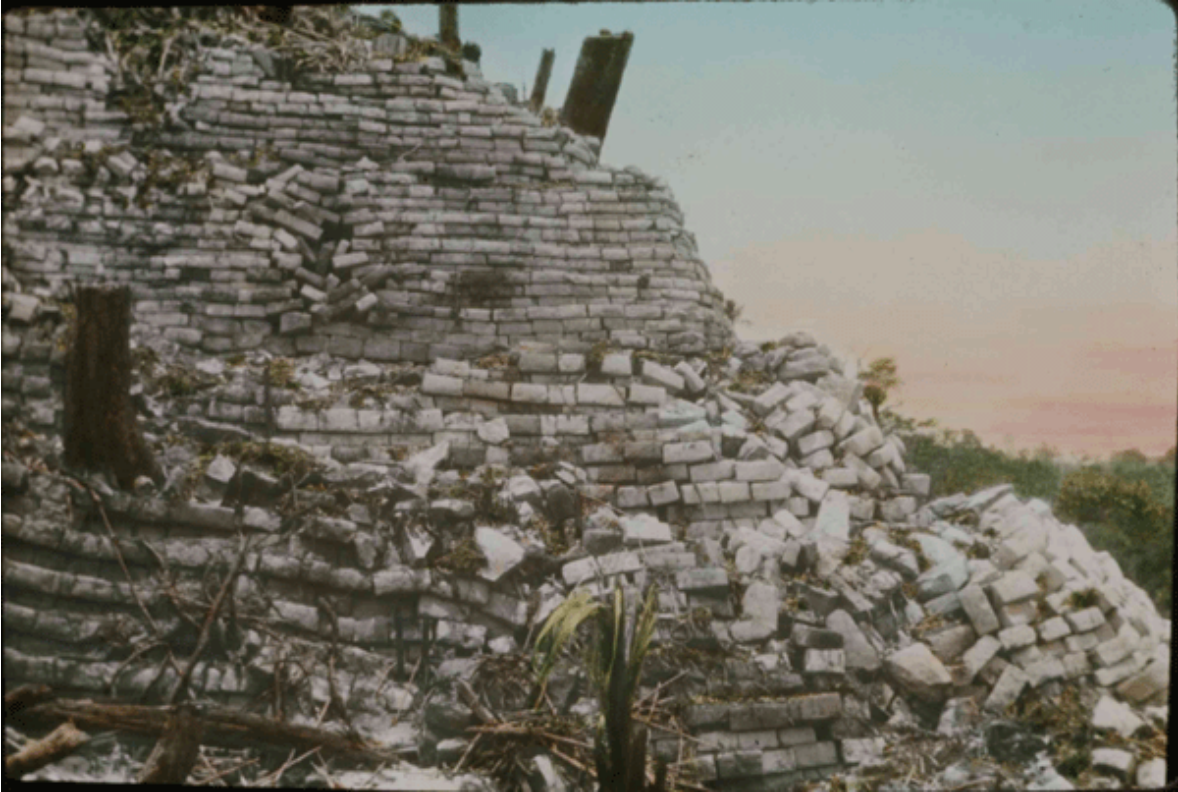
Lubaantun, the Mayan "City Of Fallen Stones"