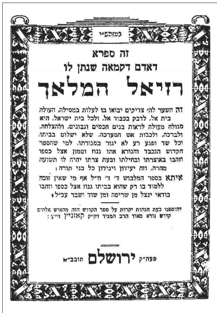
The book, Raziel ha Malaach , The Angel Raziel , ascribed to Adam.

ago (according to the Hebrew calendar and to the date of writing these lines in 2006). Although many generations preceded Adam, he was the first person in whom the