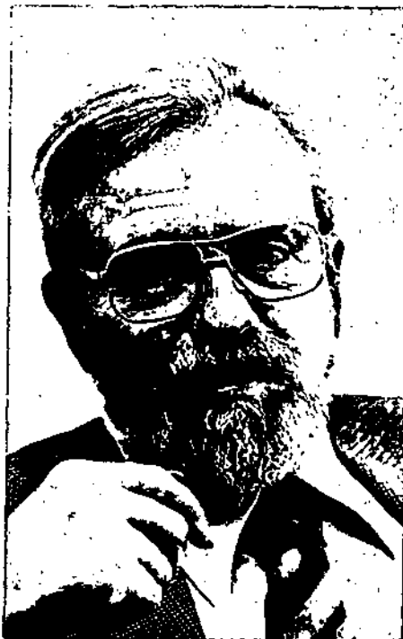
J. Allen Hynek, PhD, Scientific Director of CUFOS