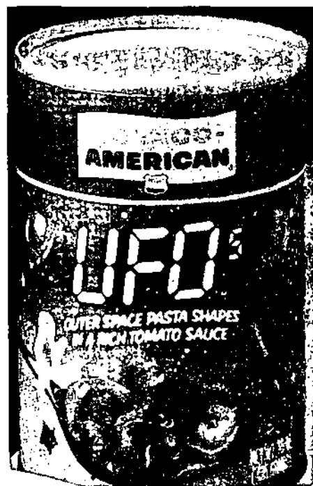
UFOs as "Pop Culture"

Letters to the Editor are invited, commenting on any articles or other material published in the Journal. Please confine them to about 400 words. Articles of about 500-700 words will be considered for publication as "Comments" or "Notes." All submissions are subject to editing for length and style. Please type and double-space all articles.