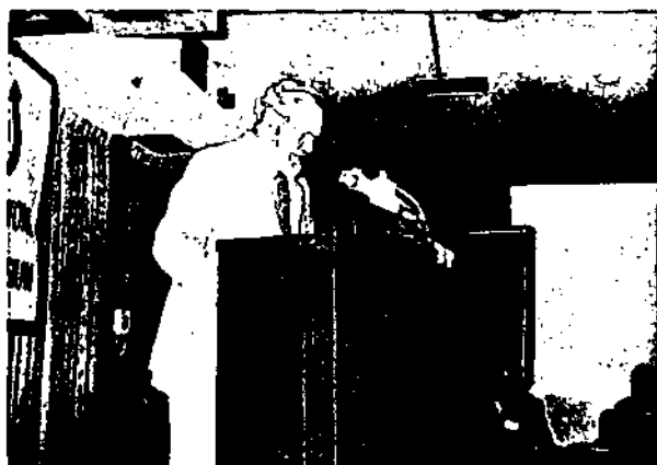
Dr. J. Allen Hynek, Director of CUFO, addressing the symposium