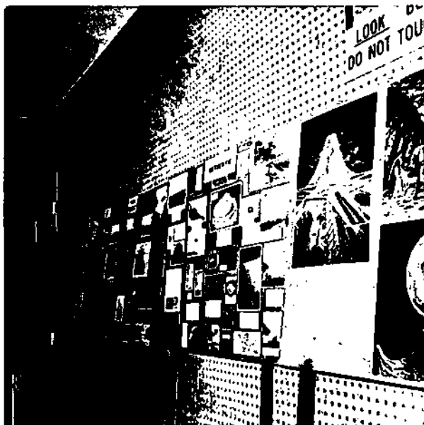
Visual UFO Display