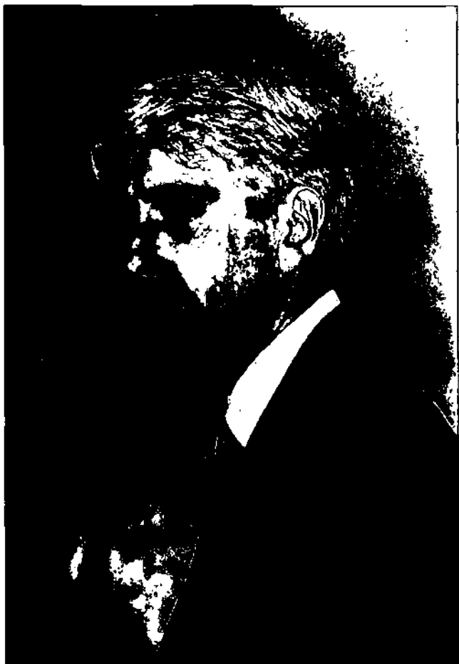
Jacques Vallee's Forbidden Science: The UFO Phenomenon and the Research Community

Some cinema buff out there can probably correct me, but if my memory serves, the late French film director Francois Truffaut once did a b&w film by the title of "Don't Shoot the Piano Player." Ironically, Truffaut also played the character Lacombe in the Steven Spielberg production of "Close Encounters of the Third Kind," a role loosely based on the real-life career of Jacques Vallee, arguably the most prominent (and controversial) ufologist of this or any other century. Vallee must now feel as if art really does imitate life; for the more he expounds his message to the UFO community, the more body shots he has been forced to absorb in the process. The tragedy is that his unsettling message has largely been lost among the smoke and sound of gunfire.