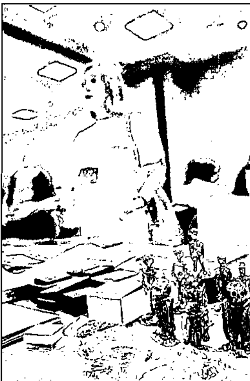
Gloria Wingfield at the crop circle table.