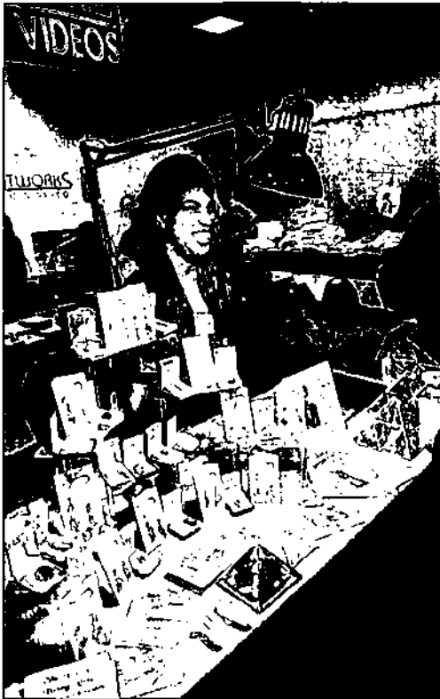
Inside the vendors' room.