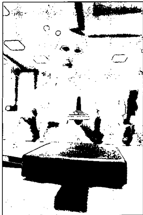
UFO top floats, but will it fly?