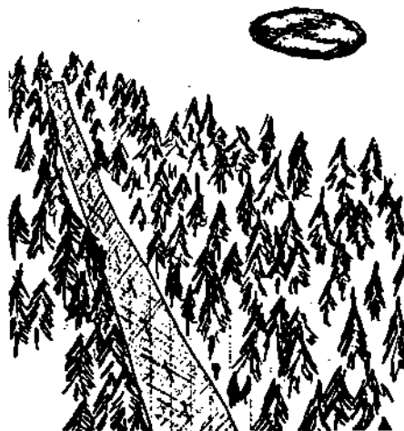
August 11, 1982 Maple Valley, Wash.