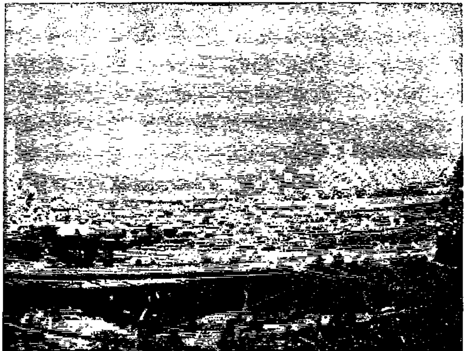
Videotape picture of UFO-like object, faintly visible here as elongated object in center above skyline

Later on that afternoon while I was reviewing the material on the tape I saw a flash go by and I took another look at the frames going by one at a time. I noticed what looked like a cloud going by on four frames. The more I looked at this cloud it seemed to have a form to it with somewhat of a long trail almost. I called Channel 11 up at first but they weren't able to send a reporter out that day. I called the UFO Reporting Center in Seattle and they said that they would contact me on Monday. Then on Monday I went over to Channel 11 to have them check over the tape I had to see what they thought it was. One thing that was a little odd: their viewer showed an electrical disturbance everytime the object came on