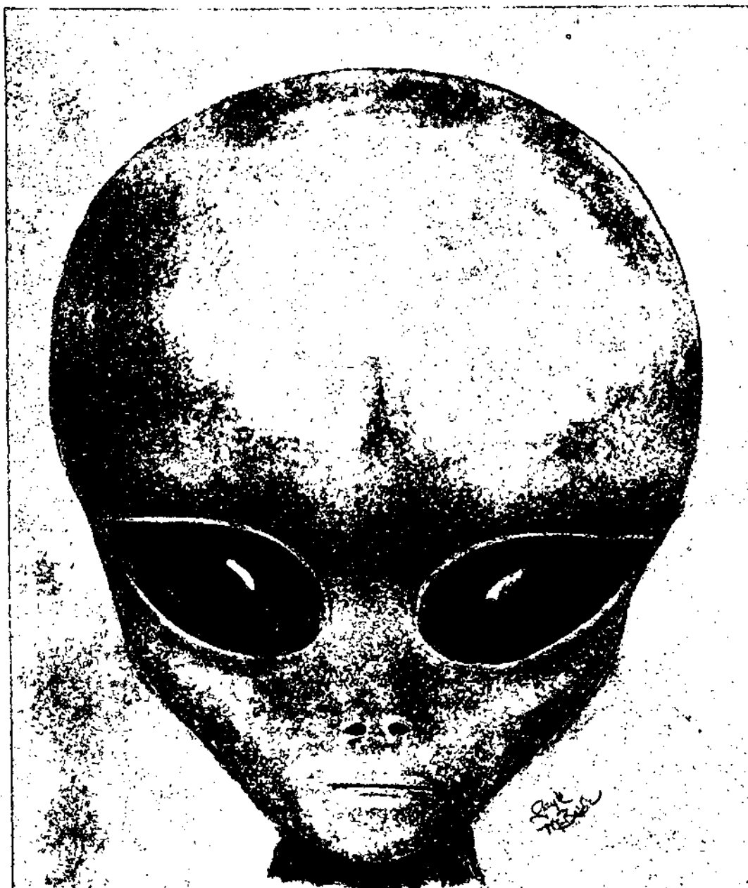
RENDITION OF REPORTED ALIEN HUMANOID