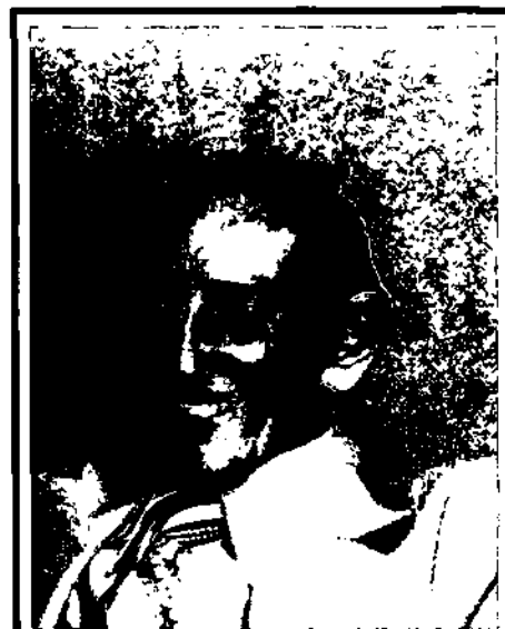
DONALD E. KEYHOE 1897 - 1988

Director so they may be formally nominated. State Directors may nominate themselves. This is an opportunity for a dedicated person to help influence the goals and objectives of MUFON and the future of Ufology. Please give this matter your prompt and serious consideration since only two nominations have been received by MUFON in Seguin, Texas as of November 21, 1988. We hope to have at least four nominees so there will be a choice of qualified candidates.