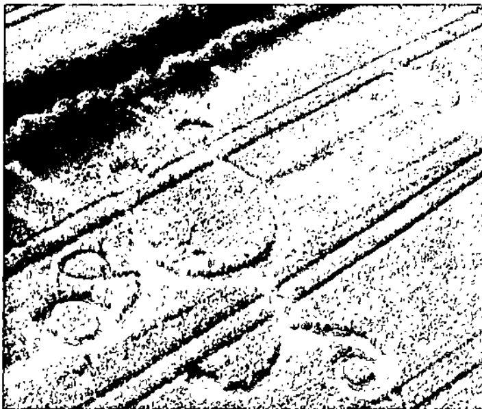
Chilcomb, Hampshire, July 1991

Watch this space. There is quite definitely the smell of a great big dirty rat here and there are now two or three investigative journalists working on it. With a general election in the offing, this imbroglio could provide some quite interesting "ammunition" for the opposition parties.