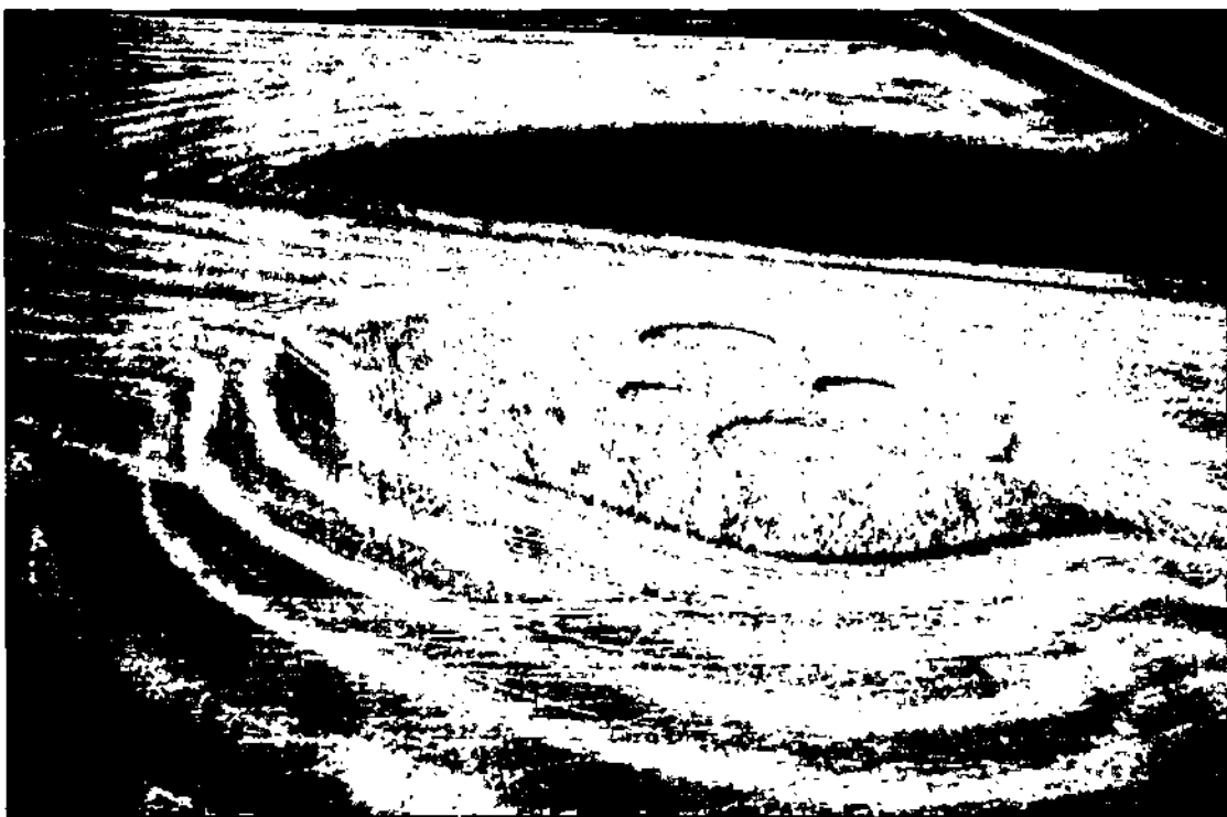
"Four Brothers" Quadruplet near Warner, Alberta

Another feature which was repeatedly mentioned was the strange behavior of animals, and especially the excessive, unusual, or uncharacteristic barking of dogs prior to the discovery of a formation. This was not just common knowledge in the area, but was mentioned quite specifically by some.