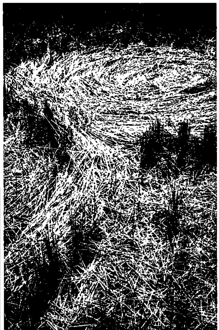
The Eddy-Effect / Chad Deethen

First of all, it was a near-duplicate of the Lethbridge/TV station triple-dumbbell formation of six days earlier. There was disturbed dirt near the center of one of the satellite circles, and another had a dirt fracture running through the center. The largest circle was not neatly formed, and one section of the circumference was perfectly straight, rather than curved, for a distance of 5.5 meters. As well, there was what appeared to be a partially-started circle about 20 meters from the main