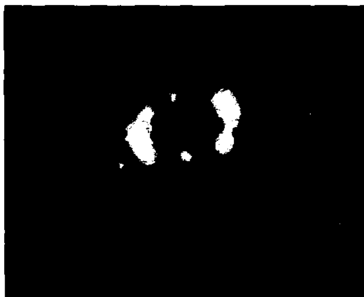
Ring of Lights, Gulf Breeze, Florida

But there it was. I know. I saw it. So did 33 other people with almost that many binoculars, a dozen cameras and several video recorders.