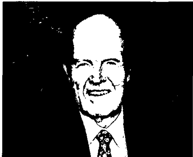
Col. Gordon Cooper

During the question and answer session, Col. Cooper