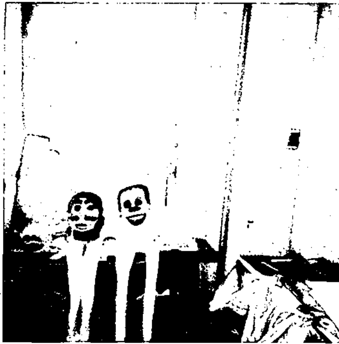
The Hallowe'en Masks