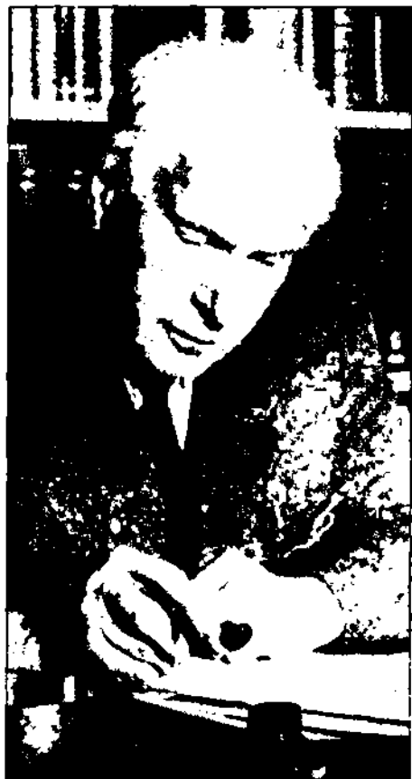
C. J. JUNG

Unfortunately, Jung's purely speculative sallies into alternative interpretations have led to considerable misunderstanding — a very active misunderstanding that was prepared to latch onto anything to feed itself. This misconception has resulted in some ufologists claiming that Jung supported this, that, or the other theory, simply because he mentioned it and made a few cogent comments.