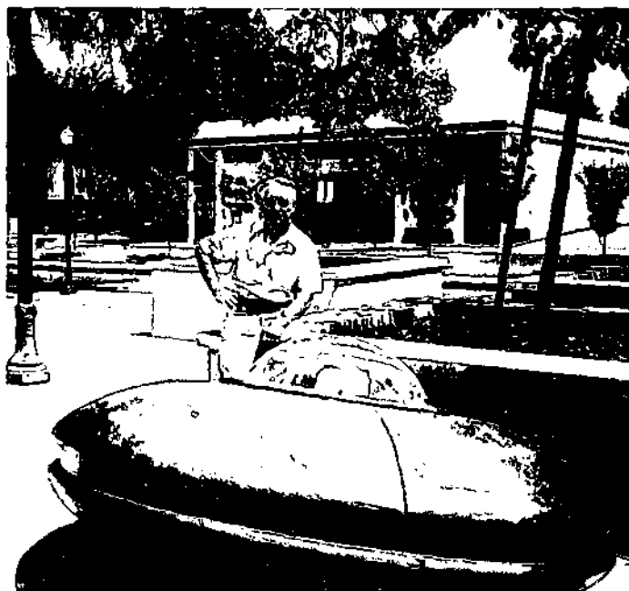
PAUL C. CERNY UFO Crash in Mountain View in Civic Center (California)

August 14 & 15 — International UFO Conference, "UFOs: Fact, Fraud or Fantasy," Sheffield Polytechnic, Main Building on Pond Street in Sheffield, So. Yorkshire, England. For information please contact Independent UFO Network, 1 Woodhall Drive, Batley, West Yorkshire, England WF17 7SW.