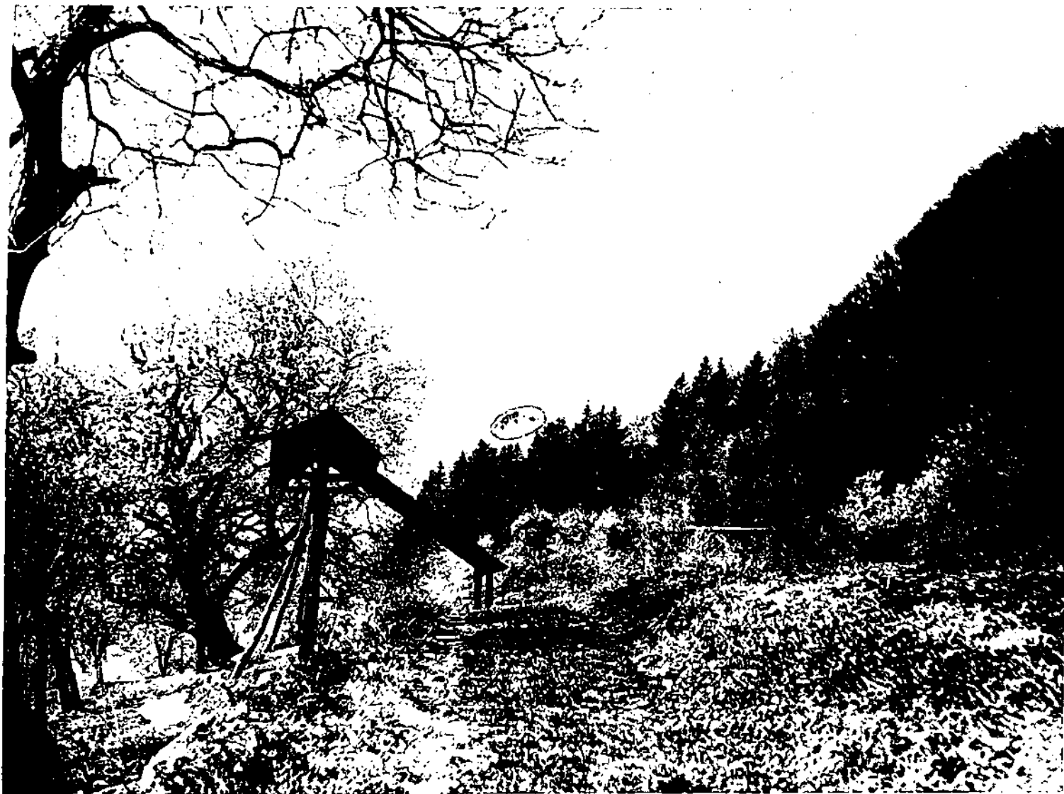
Reconstructed photograph of area near Senozeti, Yugoslavia, where several people witnessed a UFO in February, 1977.