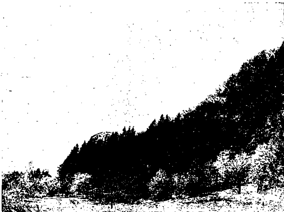
Another reconstructed photograph of UFO and actual area in which it was seen.

far from our house. We listened attentively but there was no sound whatsoever, coming from around us. There was complete silence. Neither did we notice any smoke or something like that coming from the spot. We really did not know what it was all about. People who know us belived us for they know we do not tell lies.