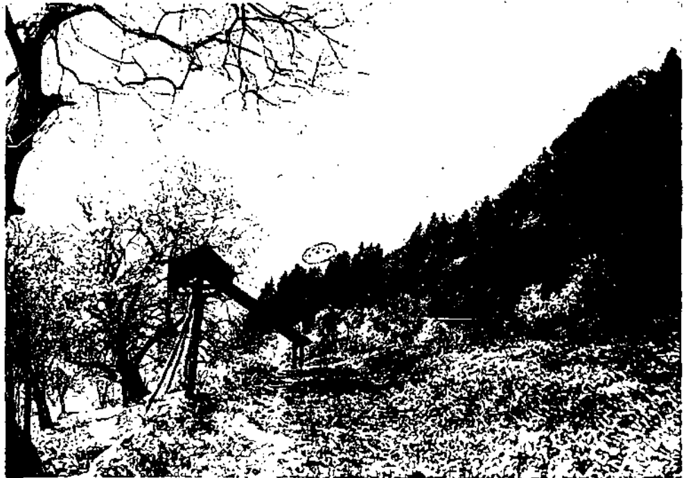
UFO is reconstructed over actual photograph of the area.

Not long time ago UFO-NLP Sekcija ZVEZA SOLT Studentsko naselje blok VII 61000 Ljubljana, Slovenija, Yugoslavia, which is the oldest and most known UFO organization in Yugoslavia, sent a letter describing a UFO spotting. Two of our members went to the field investigation, and in order to obtain the most faithful picture of the event. We arrived to a little idyllic village, near Senozeti. It is situated some 18 kilometers (ten miles) from Ljubljana, its altitude being relatively high, about 700 meters above sea level. The village offers a beautiful view on the surrounding hills. We soon came into contact with the two main eyewitnesses, Metoda G, 18 years old. (We have their address in our files) She sent us the above-mentioned letter, and her mother Helena G.