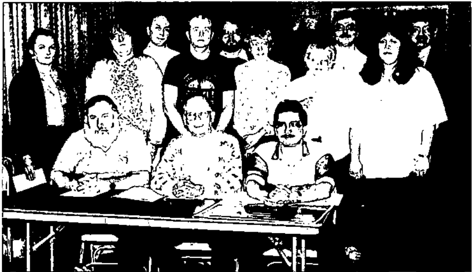
Some of the attendees at a New York State Meeting held in Auburn, NY on November 3, 1990.