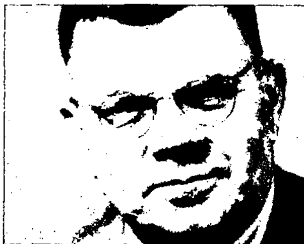
EDWARD U. CONDON

His admission that he had reached a negative conclusion before the study was really underway belied his