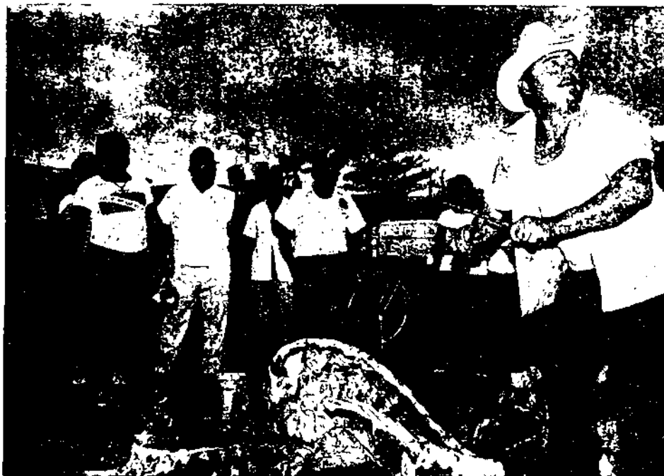
Butchered bull in Isla Mujeres, Mexico