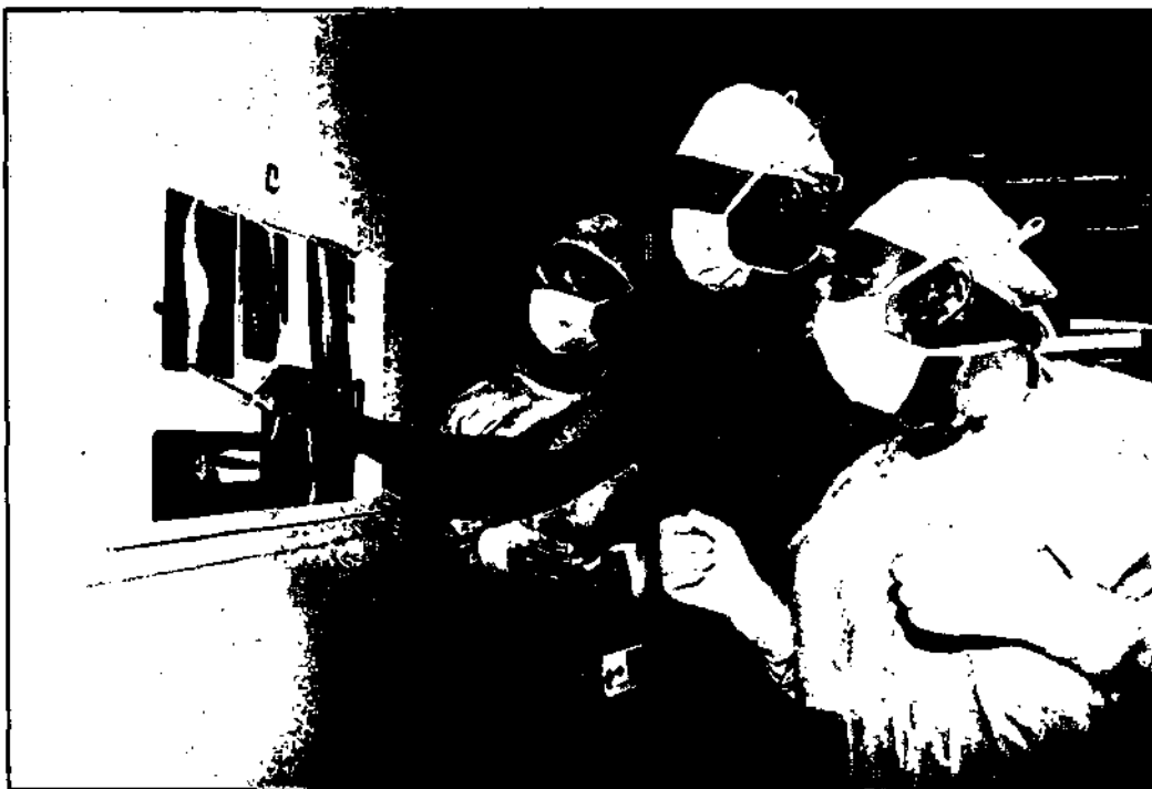
Surgeons review x-rays.

These are all covered with a very strange tough dark gray membrane that rejects opening with a surgical blade until the objects have been dried for 24 hours. Analysis of the membrane shows that it is composed of the body's own tissues and contains only three major factors: a pro-