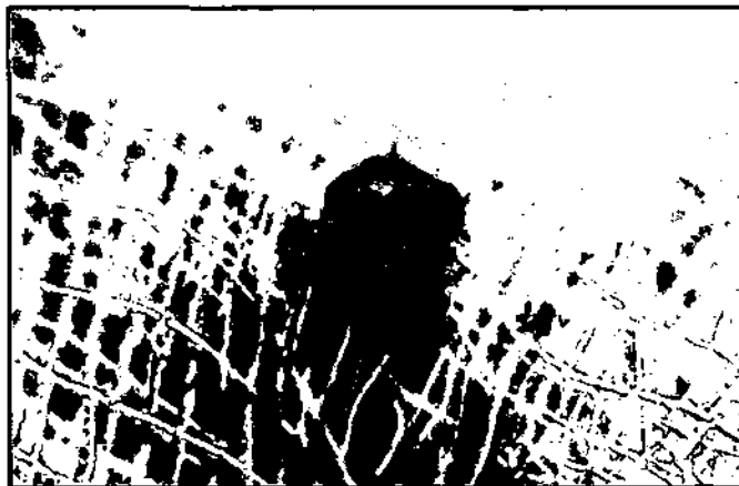
Object on a surgical sponge.