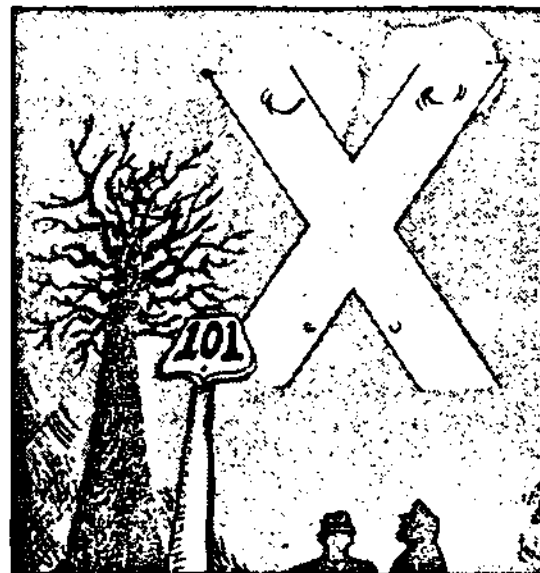
Artist's rendition of UFO based on Petaluma eye witness accounts

None of the witnesses could accurately determine the distance and height of the object. All but one witness was in a moving car with their windows