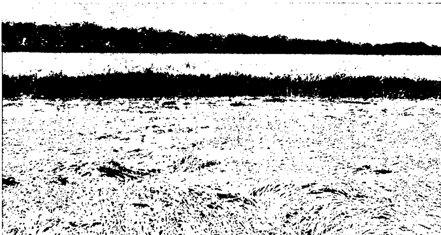
Photograph of the apparent crop circle near the city of Yeisk in the Krasnodar Region