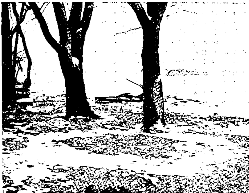
PHOTO MADE BY TED PHILLIPS, MUFON SPECIALIST IN LANDING TRACE CASES ON DECEMBER 4, 1971. NOTE WATER ON GROUND, BUT SNOW DID NOT MELT IN RING AREA. THE SOIL WOULD NOT ABSORB WATER. DEHYDRATION OF SOIL EXTENDED TO A DEPTH OF 14 INCHES IN RING.