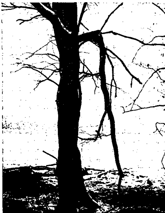
THIS LIMB WAS APPARENTLY TWISTED AND BROKEN DUE TO FORCES ASSOCIATED WITH THE HOVERING OBJECT. NOTE STANDING WATER AT THE BASE OF THIS TREE, SINCE SNOW WAS MELTING.