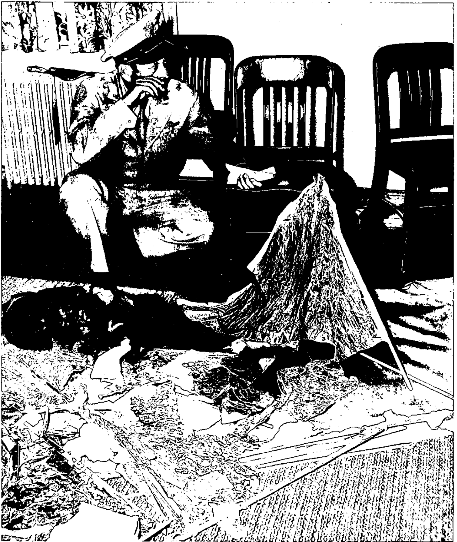
Brig. Gen. Roger Ramey views a portion of the debris collected near Roswell, New Mexico in his office.