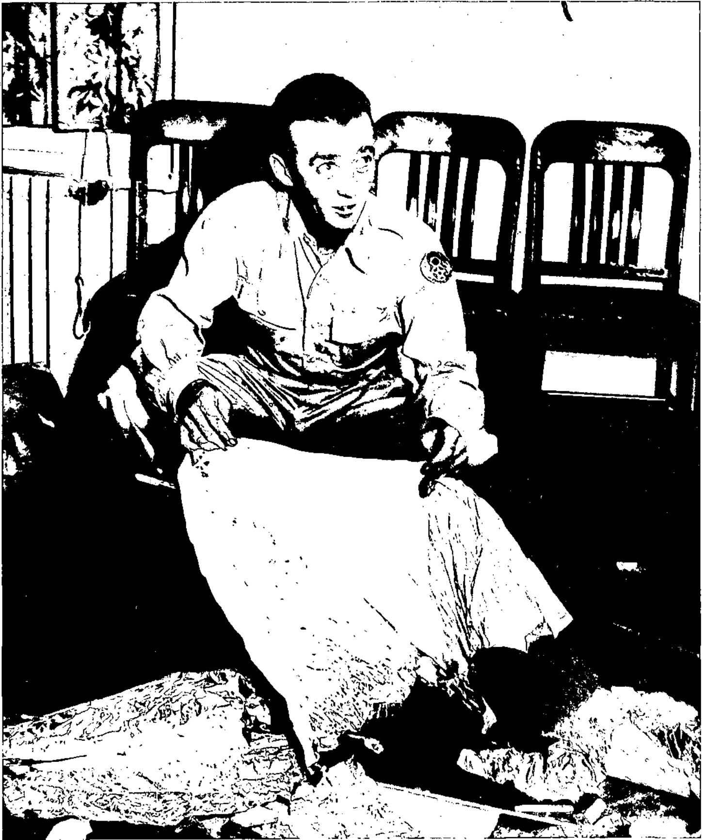
Major Jesse A. Marcel, S-2 (Intelligence) Officer, Roswell Army Air Base, poses for photographer in Brig. Gen. Ramey's office in Fort Worth, Texas.