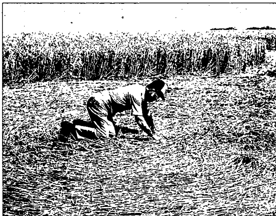
Walt Andrus inspecting crop circle formations south of Silbury Hill. One of eleven circles in adjoining fields.

Order From: MUFON, 103 Oldtowne Rd., Seguin, TX 78155-4099