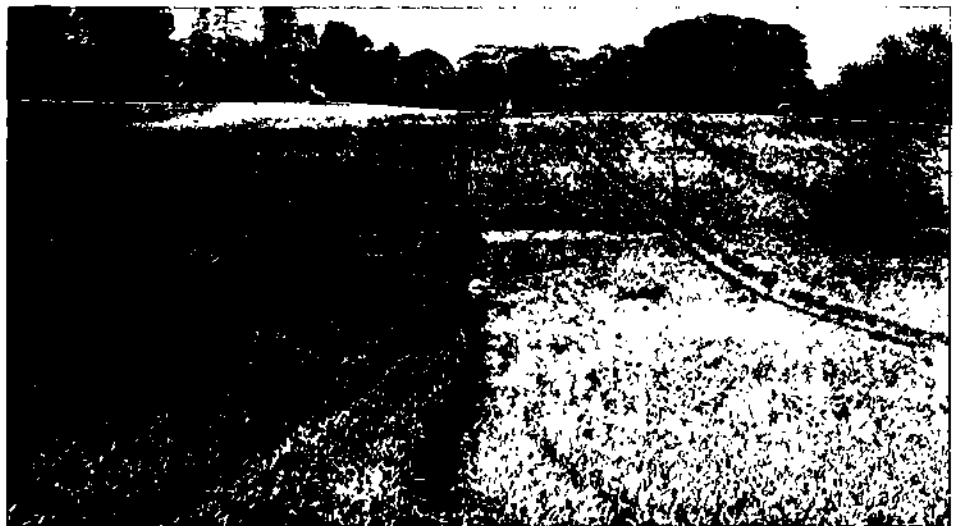
1991 Galactic Cross adjacent to Checkers near Butlers Cross.