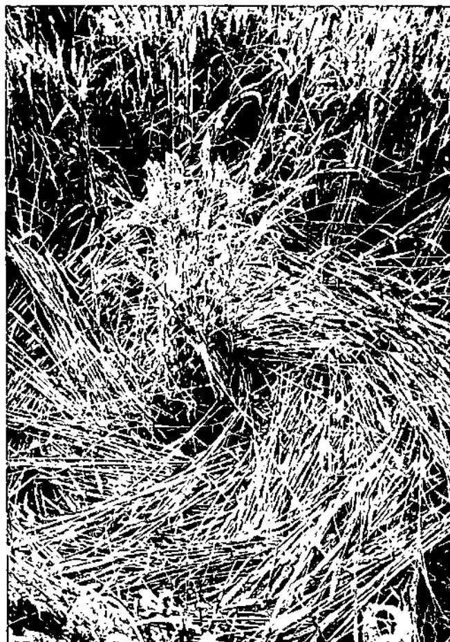
A small, undisturbed grapeshot circle with a standing "corn doll" in the center. Near Alton Barnes