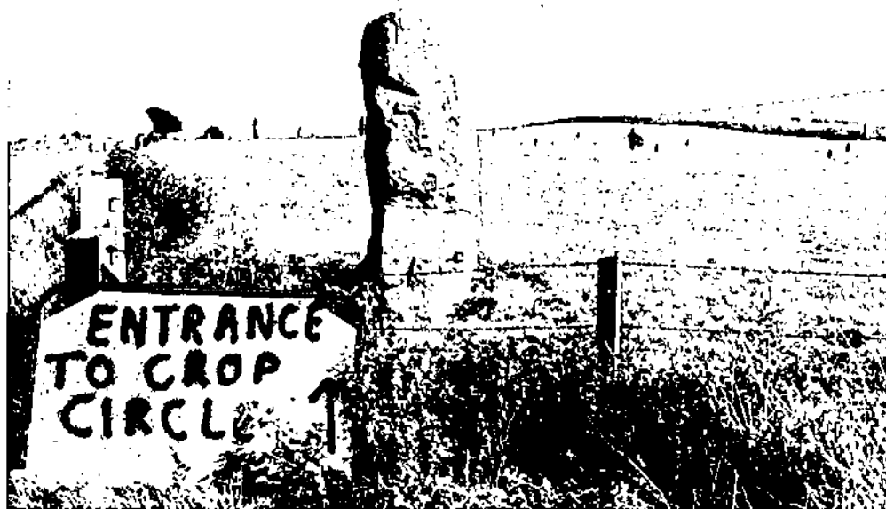
This particular circle, located in the field to the right, just happened to be "conveniently" visible from the well trafficked Red Lion pub in Avebury

permission to enter their fields and collect samples. He gave her the coordinates of the field we thought Busty's new formation was in and we piled into a car to see what, if anything, was visible from the road.