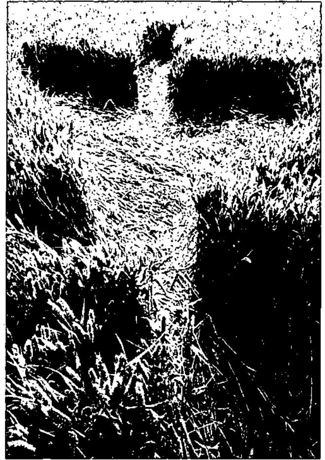
An arrowhead pointing to the Lockeridge formation Obviously added after the fact by human hands

My expectations of being able to learn much from the ground at this late date were not high. Circle formations deteriorate rapidly once word of their location gets out and the public starts pouring in. The pleasant young girl at the dredlock caravan told me that some 200 people had already visited the Snail. And what a mess they had made of it. I entered at the "head" of the thing, which consisted of another anticlockwise circle 44 feet in diameter, from which protruded two "antennae." From here a more or less straight path ran into the lower curve of the larger "shell" circle and continued onwards another 50 feet or so before culminating in yet another counterclockwise circle, or "tail," 41 feet in diameter. The long pathway itself was over ten feet wide, the wheat stalks flattened toward me as I approached the central circle, and away thereafter. A short distance away were two