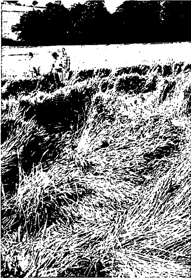
Ordinary lodging caused by wind and rain damage Note the highly irregular flow of the "floor plan"

The tramlines here pointed directly at the green ridge of east-west running hills which formed the far horizon. From their heights sailed a hang-glider or two, catching the late afternoon summer currents. Three people with tape-measures and a camera atop a tripod were already in the great central "shell" of the Snail, a flattened circle 122 feet across, laid down in a counterclockwise direction.