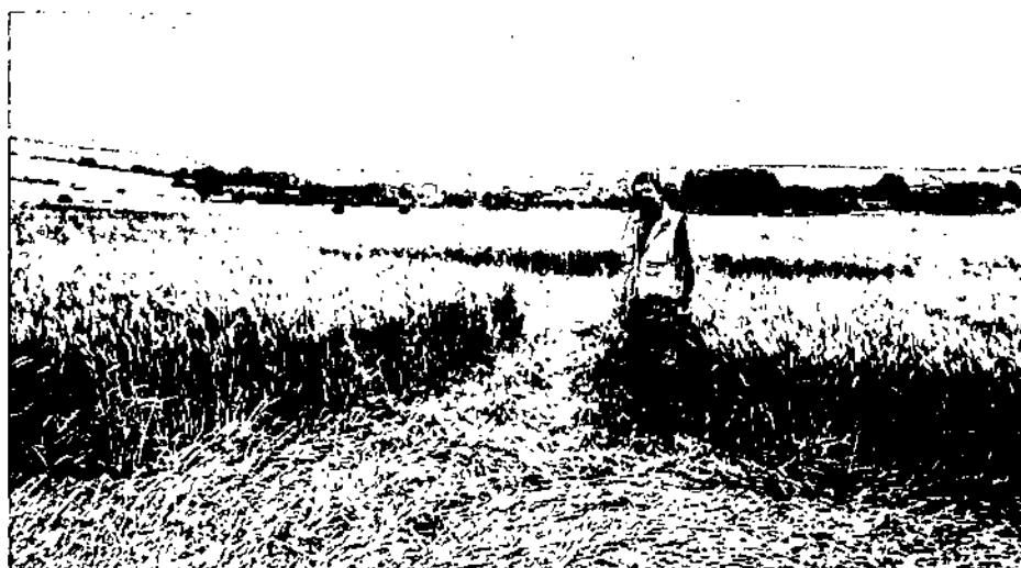
The author, in a relatively unvisited dumbbell formation with the village of Alton Barnes in the background.

hoaxes. Sage advice, but I'm not sure how well or easy it went down with the faithful.