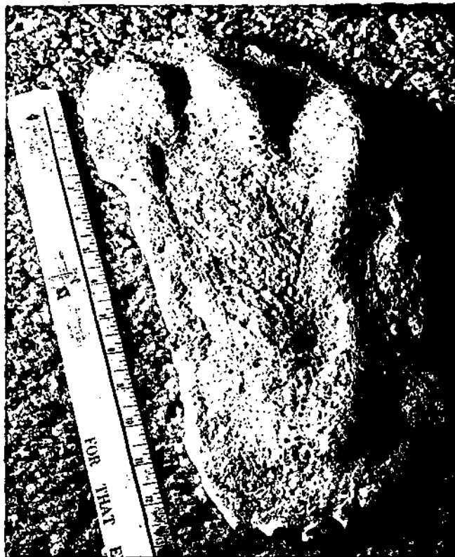
Typical three-toed print found in Pennsylvania.

The father of one of the girls went into the woods (he owned the property), according to the daughter, and stayed for over an hour. However, in an interview the father denied having gone into the woods, and he stated that there were somethings that should't be discussed. He