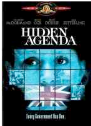
Hidden Agenda - one of the most important movies portraying the shadowy and sinister powers operating behind the terrorists of Ireland.

If you ask people to identify the paramilitary organization that has committed innumerable atrocities in Ireland for the past 60 years or so, they will be bound to mention the Provisional IRA. But ask people to identify the secret societies from which the IRA arose and you'll be greeted with silence, head-scratching, and puzzled brows.