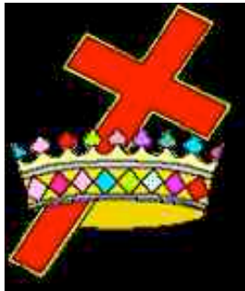
The emblem of the Black Preceptory, or Royal Black Institution. Their festival day falls on July 13th. (Click pic for more info.)