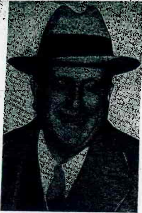
WILLIAM RANDOLPH HEARST Red-hunter-in-chief, boss of the American Legion, who nurses the fascist plot

many more millions available if necessary, is now on a campaign to get 4,000,000 members—a powerful band if properly financed by the country's leading financiers.