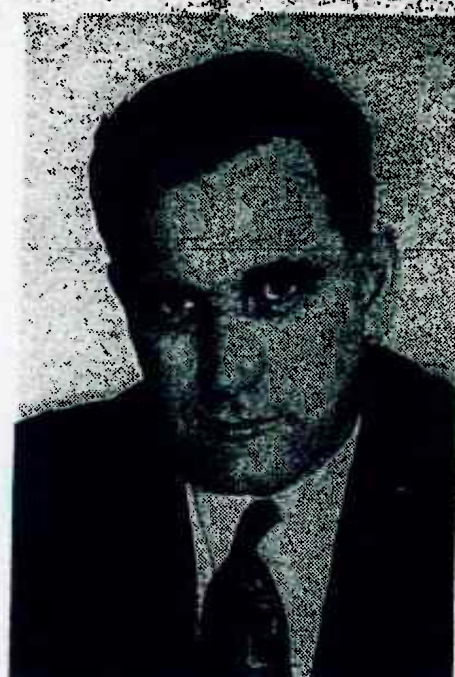
JOHN W. McCORMACK