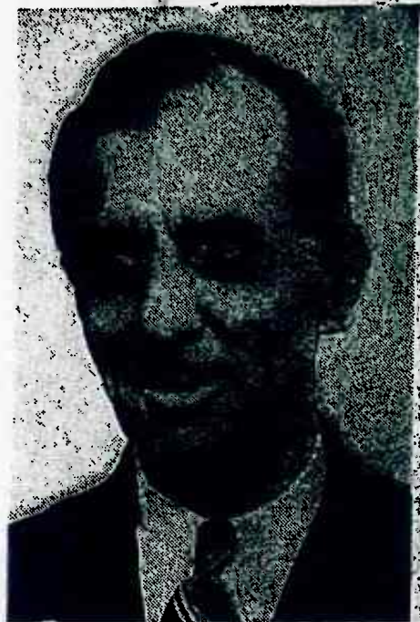
GEN. SMEDLEY D. BUTLER

Who tried to get Gen. Smedley D. Butler to organize a fascist army