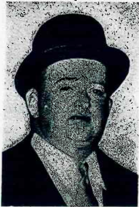
GERALD C. MacGUIRE

Morgan's man, who kept Gerald C. MacGuire on his payroll