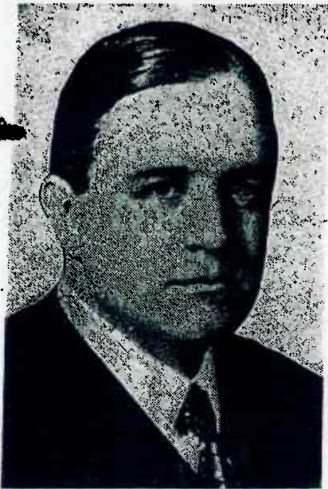
GRAYSON M-P MURPHY

Morgan's man, who kept Gerald C. MacGuire on his payroll