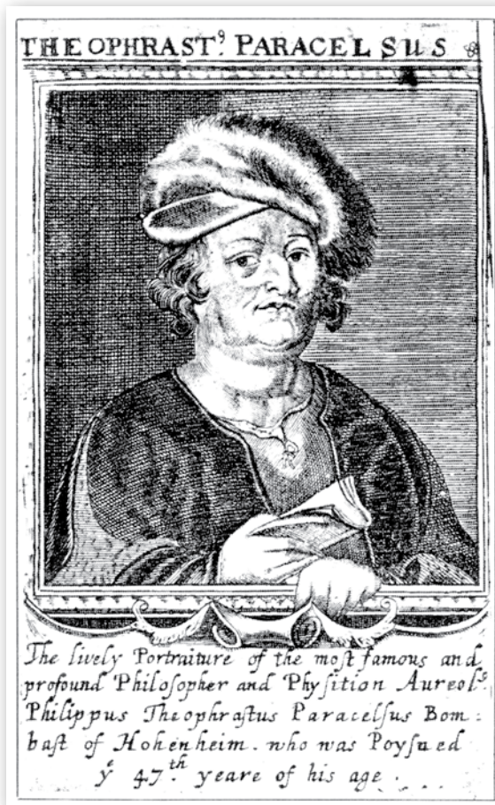
From Philosophy Reformed and Improved, London, 1657 Early Portrait of Paracelsus, including a reference to the circumstance of his death.