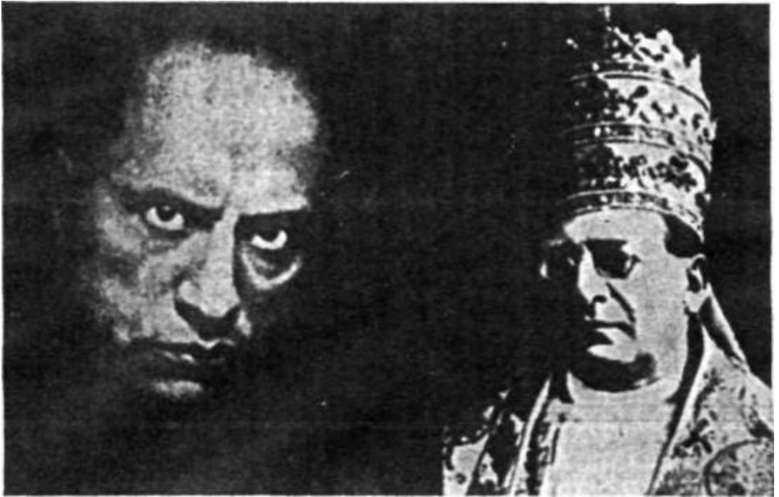
IL DUCE MUSSOLINI

Pope Pius XI styled Mussolini . . . "a gift of Providence, a man free from the prejudices of the politicians of the liberal school."