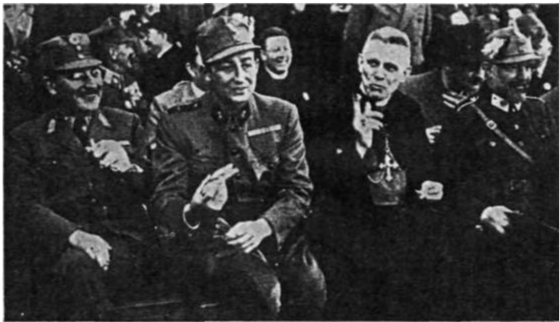
Left to right: DR. SCHUSCHNIGG, PRICE STAREMBERG AND CARDINAL INNITZER SMILE THEIR APPROVAL OF DOLLFUSS.