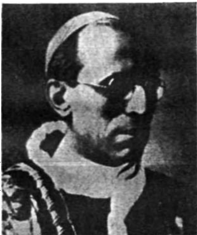
EUGENIO PACELLI—HOW POPE PIUS XII

The idea of a Chief of Christendom, himself also a Chief of State, presiding over an assembly of Chiefs of State, is a medieval conception which has no place in our twentieth-century democratic world. It has been revived for political reasons, and unless denounced, will prove a dangerous challenge to freedom and progress. For just as the equality of individuals, the equality of nations is a fundamental principle of democracy.