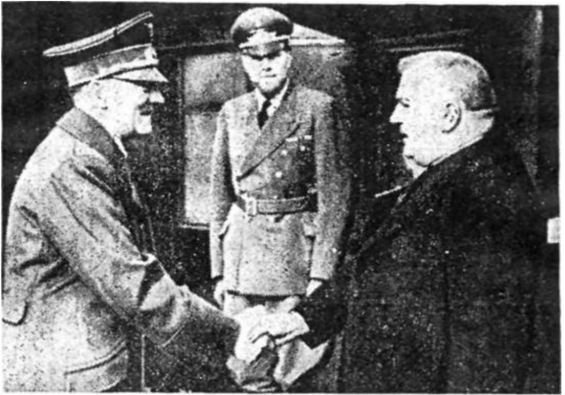
Reichsfuehrer Hitler greets the Rt. Rev. Msgr. Joseph Tiso, Slovakian Chief of State, Papal Chamberlain and Roman Catholic priest, at Hitler's field headquarters on the Eastern Front, October, 1941.

sistance, utterly destroying national unity, confusing and demoralizing the people at the very moment when German troops on the Austrian border at Bratislava stood ready for the occupation of the Slovak capital.