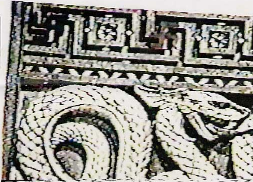
imbedded swastikas on front of Scottish Rite Masonic Temple in D.C.

Also, ask yourself why Dan Brown didn't emphasize that leading Masonic philosopher Manly P. Hall said "the seething energies of Lucifer are in his [the Mason's] hands." Hall's books can be found in Masonic libraries around the world, as can Morals and Dogma by Albert Pike who revised the Scottish Rite of Freemasonry. Pike in this book also praised Lucifer, as he likewise did in his Indo-Aryan Deities and Worship (remember there's a connection between the Aryans and swastikas). In addition, Freemasons often say they seek "more light," and Pike said Lucifer is the "Light-Bearer." Most Masons are unaware of its true intentions or meanings of its terms, as Pike in Morals and Dogma revealed that those in the blue (lower) degrees are "intentionally misled."]