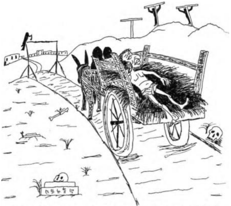
UNCONSCIOUS HORUS IS TAKEN FROM HIS 'T'.

Hoseph had then gone to the place of the skulls to watch the execution. Dicomemus and his servants had stayed and guarded the tomb, and had set up two lookouts to see if anyone was approaching. Meanwhile, at the execution site, Canner Simon had independently blended with the crowd and had shouted like a loyal Genius. Horus had been on the "T" structure for almost three hours and had gotten thirsty. When Horus had asked for water, Canner Simon had wet the sponge with vinegar he had carried, and had put it on the reed for Horus to drink. He had seemed to drink regardless of the vinegar taste, almost drying out the sponge. Then Horus had looked out into space and his eyes had blurred.