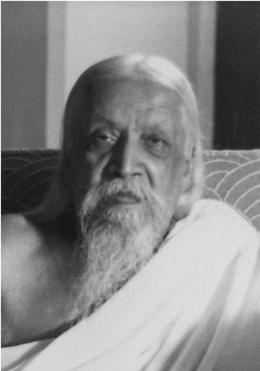
Sri Aurobindo in 1950